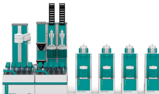
Figure 1. OMNIS Sample Robot S with Dis-Cover functionality, Dosing module, and OMNIS Advanced Titrator equipped with dSolvotrode for the determination of acid value and free fatty acids.

To a reasonable amount of sample, a solvent mixture consisting of ethanol and diethyl ether is automatically added, and the solution is stirred for one minute to dissolve the sample. Afterwards, the sample is titrated with standardized ethanolic potassium hydroxide (KOH) until after the equivalence point is reached.