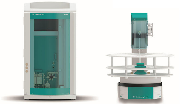
Figure 1. Instrumental setup including a 930 Compact IC Flex Oven/Deg and a 919 IC Autosampler plus.

A one-point calibration with the standard solution of 0.08 mg/mL of USP Calcium Acetate was used for quantification. Samples were evaluated as triplicates. Repeatability studies are done with 6-fold injections.