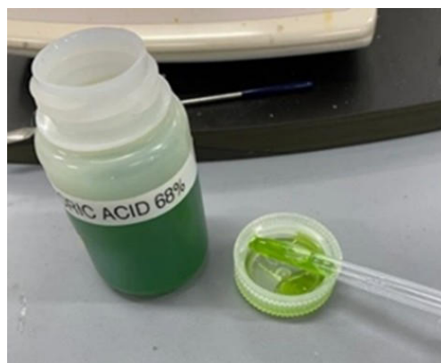
Figure 1. Phosphoric acid sample provided by the manufacturer.

Sample preparation: A 68% phosphoric acid production sample was obtained directly from a phosphate manufacturer (Figure 1). Phosphoric acid samples were prepared by serial dilution of the concentrated solution to obtain samples with concentrations ranging from 0.14% to 28%.