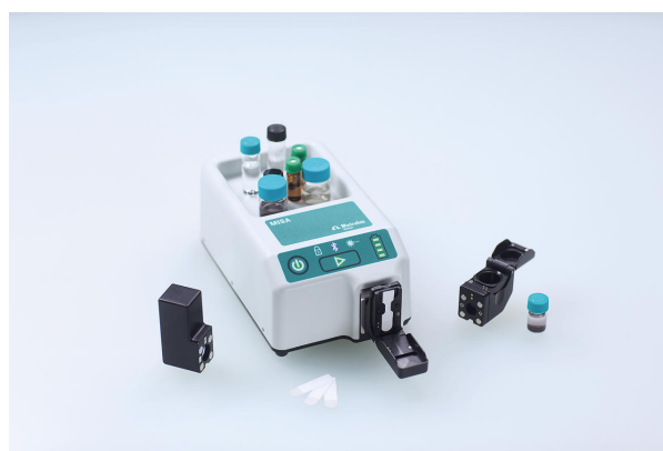
Table 1. Experimental parameters

For simulated testing of MY in turmeric, solid MY was mixed thoroughly with commercially bought turmeric powder to yield a concentration range of spiked samples: 10 and 1 mg/g, 100 and 50 µg/g. MY was extracted by the addition of 1 mL 0.5 mol/L HCl to 100 mg of each sample in a glass vial. This suspension was shaken and allowed to settle for 10 minutes. Test samples were prepared by pipetting 100 µL of the HCl extract into vials containing 800 µL of Au NPs and 100 µL of 0.5 mol/L NaCl. Each vial was inverted to combine the components and then inserted into the vial attachment on Misa for analysis.