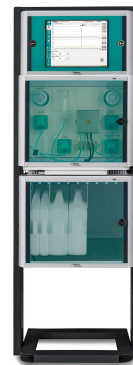
Figure 3. 2060 XRF Process Analyzer for the analysis of CTZ content in white bronze baths.

While XRF enables fast and accurate analysis of total metal content, voltammetry (VA) offers the added advantage of distinguishing free \text{Cu}^{2+} , \text{Zn}^{2+} , and \text{Sn}^{2+} ions, rather than measuring only their total concentrations. Distinguishing between these species is particularly important for monitoring the \text{Sn(II)}/\text{Sn(IV)} balance which is crucial for bath stability and plating performance. It also ensures that metal ion availability supports optimal deposition rates and bath efficiency.