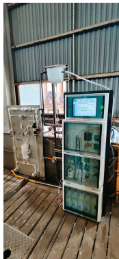
Figure 2. 2060 TI Process Analyzer with preconditioning panel in a zinc refining plant.

( Figure 2 ). Other combinations of measurements (e.g., pH), as well as measurement points taken from multiple streams, can be realized with this process analyzer.