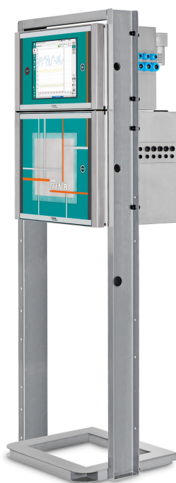
Figure 3. 2060 The NIR Analyzer from Metrohm Process Analytics.