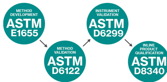
Figure 2. Different steps for the successful development of quantitative methods according to international standards.

For reproducible and accurate measurements, a preconditioning panel is necessary to filter out the particles and maintain a constant sampling temperature. Additionally, another advantage of using a preconditioning panel is that a sample take-off point can be implemented as well as a port for validation samples.