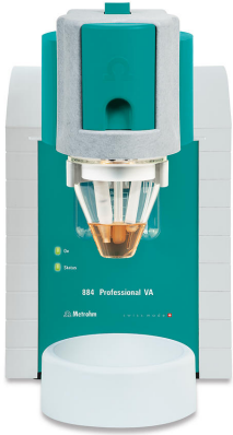
Figure 1. 884 Professional VA manual for MME.

The lfp sample is weighed, mixed with degassed diluted sulfuric acid, heated at 85 °C for 15 minutes, and then cooled. Afterward, the digested sample solution is added to the measuring vessel that contains 20 mL degassed electrolyte. Quantification is done using two standard additions with separate Fe(II) and Fe(III) solutions.