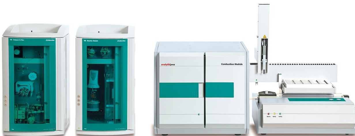
Figure 1. Combustion IC setup consisting of a 930 Compact IC flex (2.930.2560), a 920 Absorber Module (2.920.0010), a Combustion Module (Oven + ABD, 2.136.0700), and a MMS 5000 Autosampler (2.136.0800) configured for solid samples (6.7302.000).

an autosampler for solid samples, a combustion module, an absorber module, and an ion chromatograph (IC) (Figure 1).