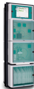
Figure 2. 2060 Process Analyzer from Metrohm for online monitoring of hydrogen peroxide during the CMP process.

Other combinations of measurements, as well as measurement points taken from a single process stream or even multiple streams, can be realized across the Metrohm Process Analytics product portfolio. All platforms guarantee fast, accurate results continuously available for true process control.