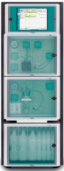
Figure 2. 2060 Process Analyzer for online analysis of ammonia and hydrogen sulfide in the sour water stripping process.

The 2060 Process Analyzer can analyze H 2 S and NH 3 simultaneously with automatic cleaning and calibration steps using absolute wet chemical techniques. Sulfide (S 2- ) is determined by a precipitation titration with silver nitrate (AgNO 3 ). Ammonia is determined by Dynamic Standard Addition (DSA). Fast and accurate results are continuously transmitted to the programmable logic controller (PLC) for process control.