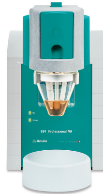
Figure 1. 884 Professional VA manual for MME.

The lfp sample is weighed, mixed with degassed diluted sulfuric acid, heated at 85 °C for 15 minutes, and then cooled. Afterward, the digested sample solution is added to the measuring vessel that contains 20 mL degassed electrolyte. Quantification is done using two standard additions with separate Fe(II) and Fe(III) solutions.