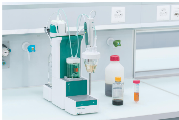
Figure 1. OMNIS Titrator setup for the thermometric titration. The data evaluation is performed with the OMNIS software.

The analysis is carried out with an OMNIS Titrator equipped with a dThermoprobe ( Figure 1 ). To avoid handling chemicals manually, all solutions are automatically dosed using an 846 Dosing Interface. The titration is based on the reaction between sodium hypochlorite and ammonium nitrogen and urea, respectively. Bromide is used as a catalyst for the reaction. As urea reacts more slowly with hypochlorite than ammoniacal nitrogen, two endpoints are obtained.