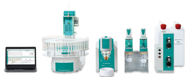
Figure 1. 884 Professional VA, fully automated for VA analysis.

Add water, the electroless Ni plating bath sample, and the supporting electrolyte into the measuring vessel. The determination of antimony(III) is carried out with the 884 Professional VA ( Figure 1 ) using the parameters specified in Table 1 . The concentration is determined by two additions of an antimony(III) standard addition solution. The scTRACE Gold is electrochemically activated prior to the first determination.