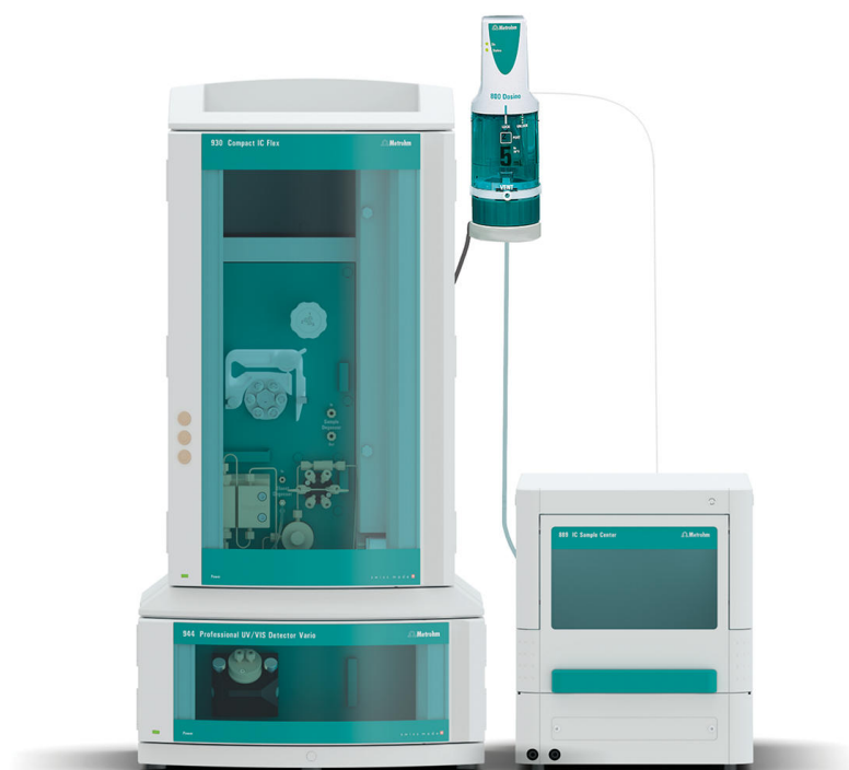
Figure 1. Instrumental setup including a 930 Compact IC Flex with a 947 Professional UV/VIS Detector Vario, a 800 Dosino for PCR delivery and mixing, and an 889 IC Sample Center – cool. Cooling can prolong sample stability.

Samples and standard solutions were injected directly into the IC ( Figure 1 ) using an 889 IC Sample Center – cool. Zinc is separated from all other cations using L91 column material (Metrosep A Supp 10 - 250/4.0 and Metrosep A Supp 10 Guard/4.0) applying the MetPac™ PDCA (pyridine-2,6-dicarboxylic acid) eluent (concentrate dilution 1:5) followed by post-column reaction (PCR) with MetPac™ PAR and subsequent detection at a wavelength of 530 nm.