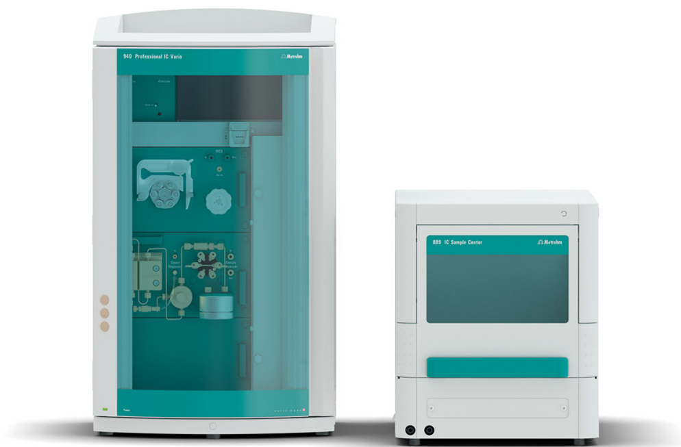
Figure 1. Instrumental setup including a 940 Professional IC Vario ONE/SeS/PP, IC Conductivity Detector (L) and the 889 IC Sample Center (R).

analyzed with a 940 Professional IC Vario using the method parameters given in the respective USP monograph ( Table 1 ).