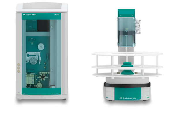
Figure 1. Instrumental setup including a 930 Compact IC Flex with IC Conductivity Detector and a 919 IC Autosampler plus.

The samples were injected directly into the ion chromatograph (Figure 1) without further sample preparation and analyzed using the method parameters given in the USP monograph (Table 1). Anionic components were separated isocratically on a Metrosep A Supp 1 - 250/4.0 column containing the alternative packing material L46. The conductivity signal was detected after sequential suppression.