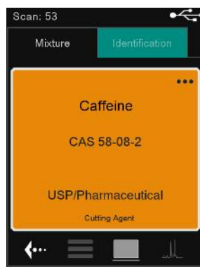
Figure 2. Actual screenshot of identification of caffeine in Yaba with MIRA DS. Caffeine is a chemical commonly associated with illicit drugs. The yellow warning background provides immediate, actionable information about the nature of the sample.