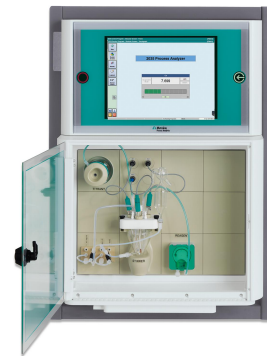
Figure 3. 2035 Process Analyzer - Potentiometric for accurate determination of TMAH in developer.

The 2035 Process Analyzer configured for potentiometric titration performs the accurate analysis of TMAH online using a combined pH electrode. Precise dosing of TMAH in the developer solution by the analyzer is also a possibility to ensure a stable concentration for every batch.