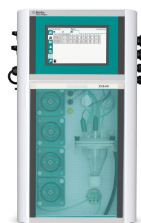
Figure 4. The 2026 HD Titrolyzer from Metrohm Process Analytics can monitor up to two critical parameters online in the anodizing process.

Aluminum is also an ideal material for other surface treatment applications. It can be cleaned using acid pickling processes to ensure complete passivation. A pickling process is also used to prepare the aluminum for applying a conversion coating as a protective surface layer.