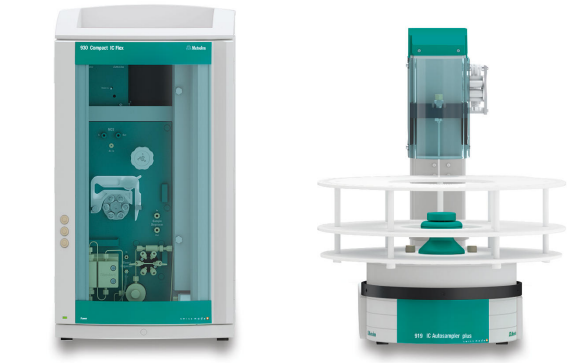
Figure 1. Instrumental setup including a 930 Compact IC Flex with IC Conductivity Detector and a 919 IC Autosampler plus.

The samples were injected directly into the ion chromatograph (Figure 1) without further sample preparation and analyzed using the method parameters given in the USP monograph (Table 1). Anionic components were separated isocratically on a Metrosep A Supp 1 - 250/4.0 column containing the alternative packing material L46. The conductivity signal was detected after sequential suppression.