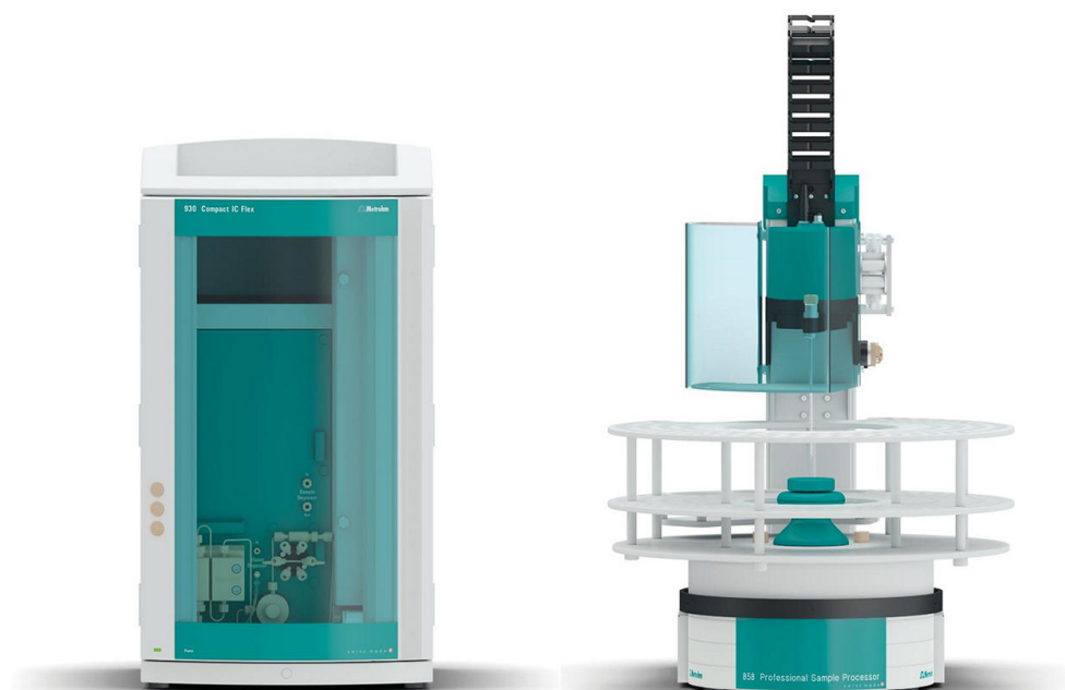
Figure 1. Instrumental setup including a 930 Compact IC Flex Oven and an 858 Professional Sample Processor.

Samples and standard solutions are injected directly into the ion chromatograph ( Figure 1 ) using an 858 Professional Sample Processor. Potassium is separated from all other cations using a Metrosep C 6 -150/4.0 column.