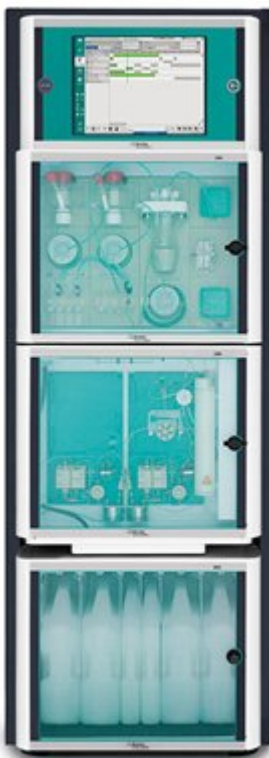
Figure 3. The 2060 IC Process Analyzer is available with either one or two measurement channels, along with integrated liquid handling modules and several automated sample preparation options.

The analysis is fully automatic. Lithium and other cationic component measurements are performed by non-suppressed cation IC followed by conductivity detection.