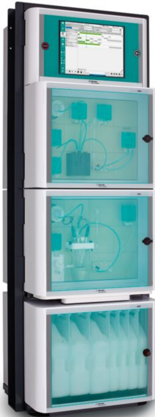
Figure 2. 2060 Process Analyzer from Metrohm for online monitoring of hydrogen peroxide during the CMP process.

Online monitoring of hydrogen peroxide, pH, conductivity, and temperature is possible with the 2060 Process Analyzer from Metrohm Process Analytics. The hydrogen peroxide