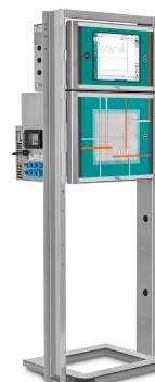
Figure 2. The 2060 The NIR-Ex Analyzer from Metrohm Process Analytics can measure %NCO in the PU production process in near real-time.

A safe and efficient method to monitor %NCO in near real-time is reagent-free NIR spectroscopy. The Metrohm Process Analytics 2060 The NIR-Ex Analyzer offers inline analysis capabilities using transreflectance and a micro interactance immersion probe. These probes are connected to optical fibers that allow the analyzer to be set up more than 100 meters away from the sampling point and still benefit from fast analyses. Additionally, this analyzer allows the connectivity of up to two NIR cabinets to one 2060 Human Interface, expanding the measurement points to ten sample streams (five for each cabinet). This gives users more savings per measurement point.