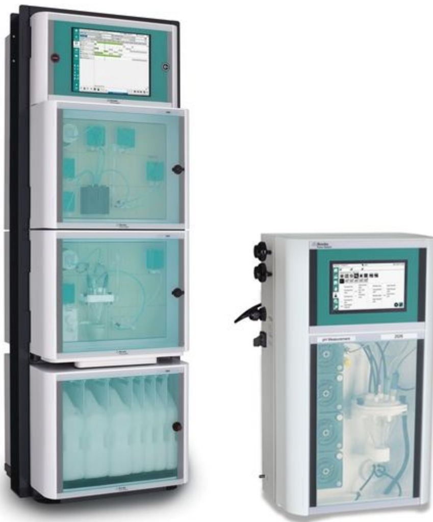
Figure 3. Some of the Metrohm Process Analytics analyzers capable of determining the ammonia concentration online. Left: 2060 Process Analyzer, right: 2026 Titrolyzer.

Online monitoring of the ammonia content is possible with either the 2060 Process Analyzer or with the 2026 Titrolyzer from Metrohm Process Analytics ( Figure 3 ). An ammonia ion-selective electrode ( \text{NH}_3 -ISE) is used in this application for quick, simple, and accurate online analysis of \text{NH}_3 concentrations in cooling water. After sampling, a Total Ionic Strength Adjustment Buffer (TISAB) solution is added to adjust the pH to 11 or higher, and the \text{NH}_3 concentration in the sample is determined using the dynamic standard addition method.