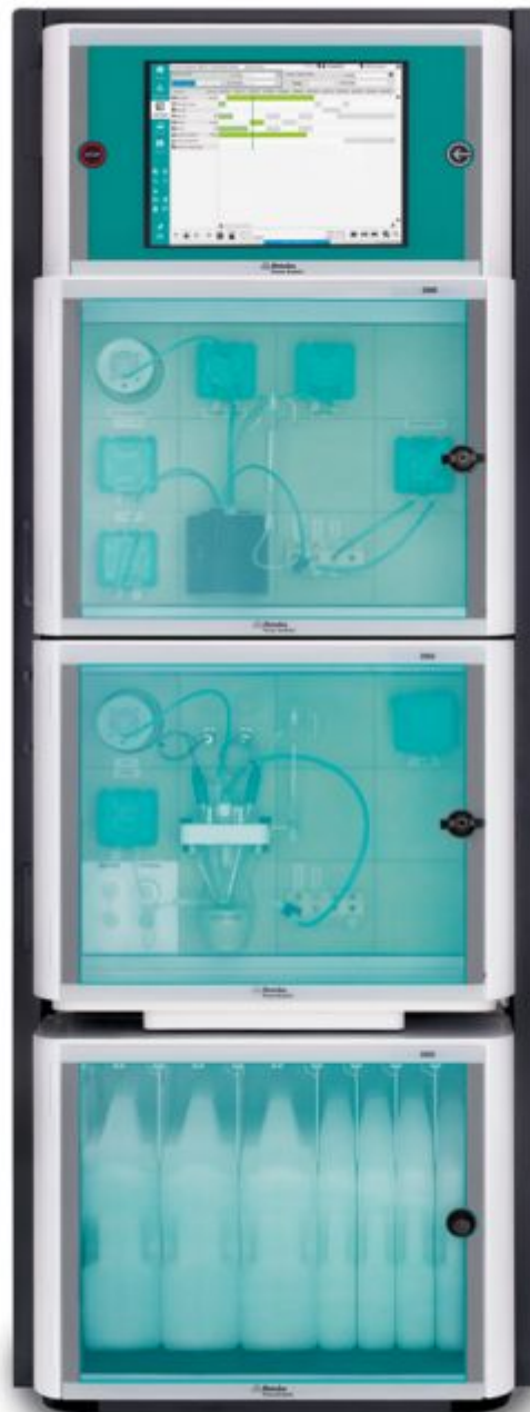
Figure 2. 2060 Process Analyzer.

The temperature and the composition of the water used in the initial stages of the brewing process is especially important for optimal extraction of starches from the milled grains. Temperature changes during mashing can adversely affect the fermentability of the sugars because of a narrow working temperature range (55–72 °C) for the enzymatic starch conversion processes. The pH of the water is not only important for mashing, but also in the lautering process , where some make-up water is needed for sparging (rinsing the sugar from the spent grains). If the pH of the mash or sparge water exceeds 5.7, the resulting beer will