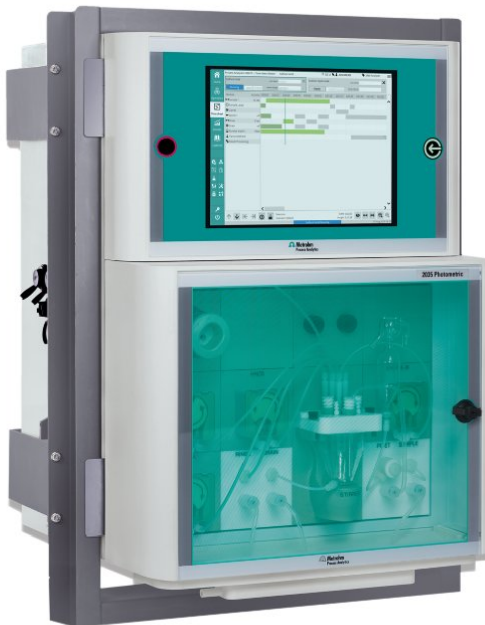
Figure 2. 2035 Process Analyzer - Potentiometric for accurate online determination of ammonia in brine streams.