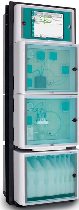
Figure 2. 2060 TI Process Analyzer for the online analysis of critical quality parameters in pickling baths using the method of titration.

Metrohm Process Analytics offers a multi-parameter process analyzer that is suitable for the simultaneous analysis of \text{Fe}^{2+}/\text{Fe}^{3+} and free acid/total acid ratio over a wide concentration range—the 2060 TI Process Analyzer (Figure 2).