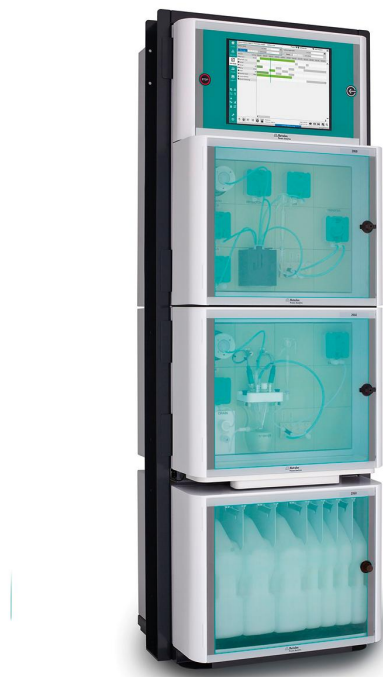
Figure 2. 2060 TI Process Analyzer for the online analysis of critical quality parameters in pickling baths using the method of titration.

Metrohm Process Analytics offers a multi-parameter process analyzer that is suitable for the simultaneous analysis of \text{Fe}^{2+}/\text{Fe}^{3+} and free acid/total acid ratio over a wide concentration range—the 2060 TI Process Analyzer (Figure 2).