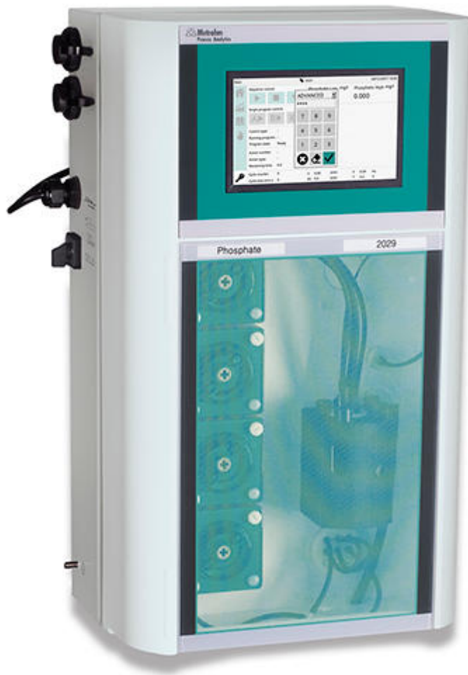
Figure 2. 2029 Process Photometer.