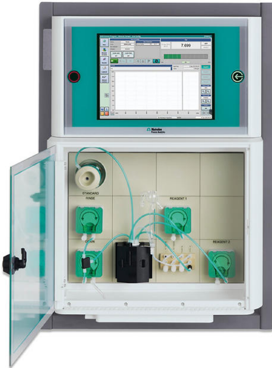
Figure 4. 2035 Photometric Analyzer.