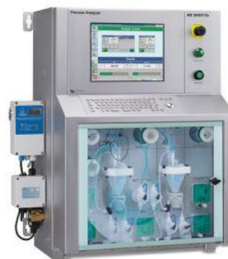
Figure 2. ADI 2045TI Ex proof (ATEX) Analyzer.

Chloride is analyzed with conductivity detection as described in ASTM D3230 with the ADI 2045TI Ex proof Analyzer (Figure 2).