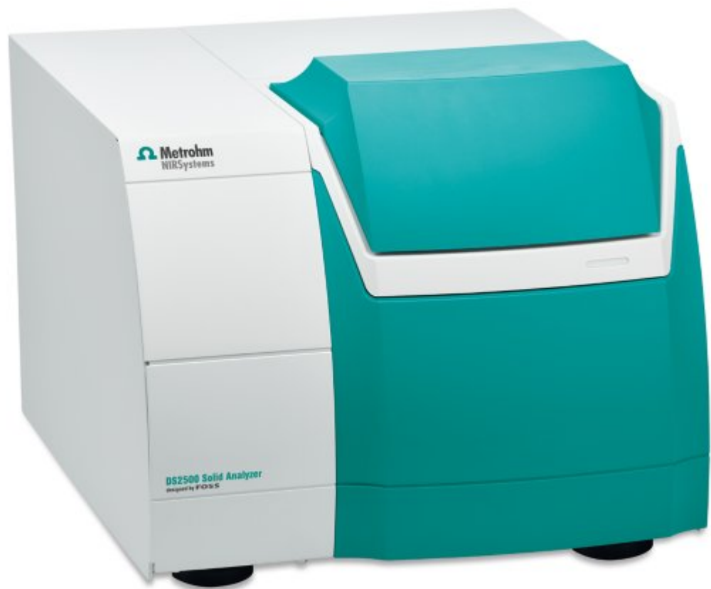
Figure 1. DS2500 Solid Analyzer.