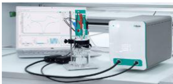
Figure 1. VIONIC powered by INTELLO.

The hydrogen permeation experiment was conducted with two VIONIC powered by INTELLO instruments from Metrohm Autolab ( Figure 1 ).