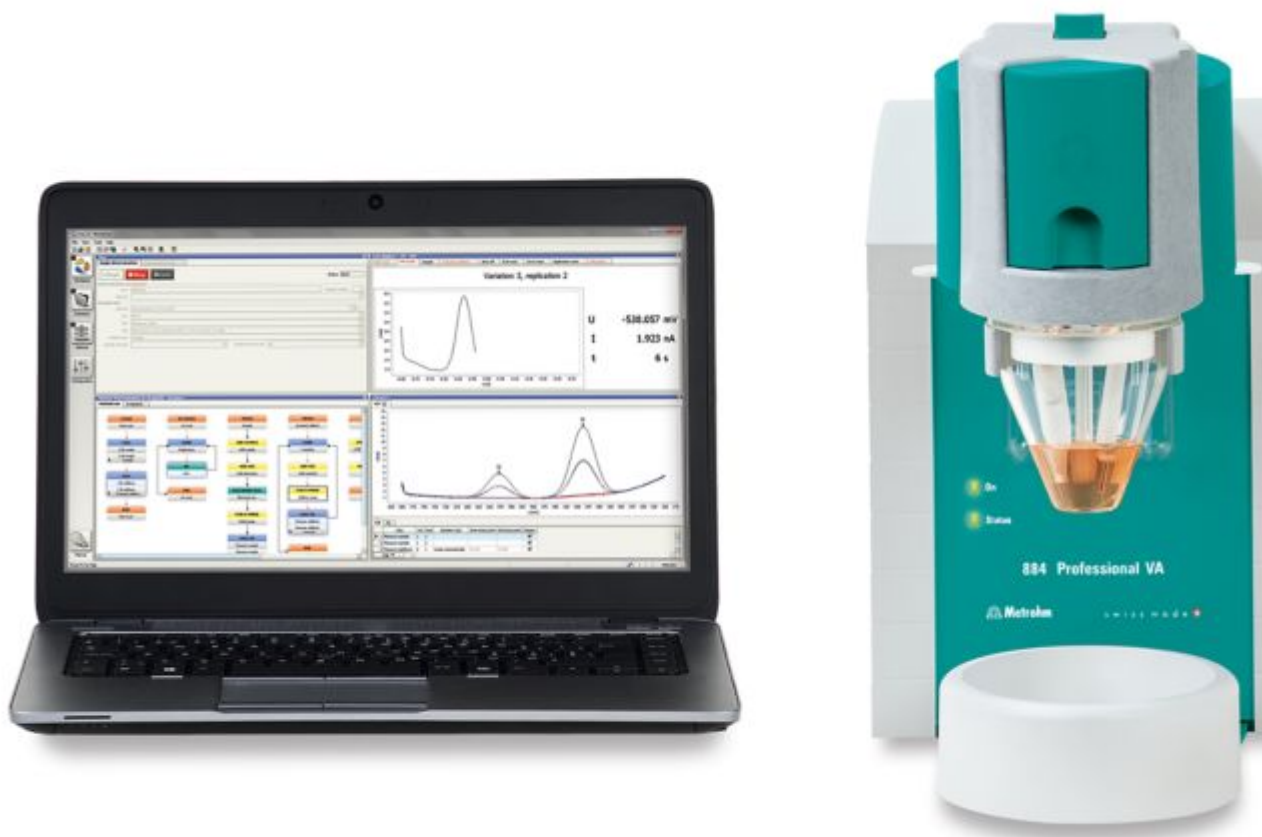
Figure 1. 884 Professional VA

First, the samples are mineralized by dry ashing in a furnace at 450 °C for 16 hours. The remaining ash is then dissolved in a small amount of concentrated nitric acid and diluted with ultrapure water. The cadmium determination is carried out on the 884 Professional VA with the Multi-Mode Electrode pro as working electrode using the parameters listed in Table 1 . The concentration of Cd is determined by two additions of Cd standard addition solution.