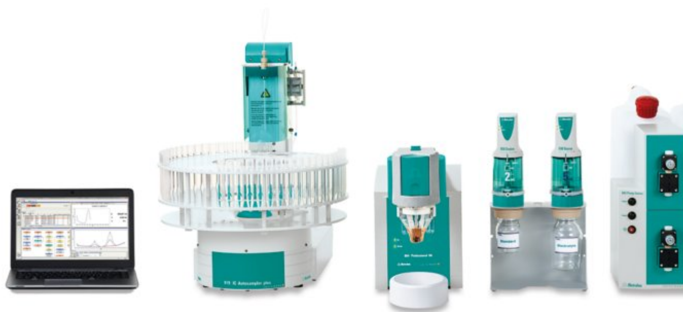
Figure 1. 884 Professional VA, fully automated for VA analysis

Prior to the first determination, the ex-situ mercury film is deposited on a freshly polished glassy carbon electrode. In the next step, the electrodes are cleaned with ultrapure water and the measuring vessel is emptied. Then the water sample and the supporting electrolyte with complexing agent (diethylenetriaminepentaacetic acid, DTPA) are pipetted into the measuring vessel. The determination of chromium(VI) is carried out with the 884 Professional VA using the parameters specified in Table 1 . The concentration is determined by two additions of a chromium(VI) standard addition solution.