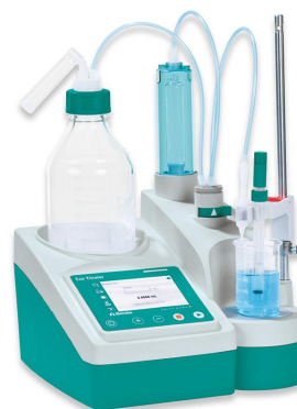
Figure 1. Eco Titrator equipped with a Ca-ISE electrode for the determination of Ca in aqueous solutions.

The sample is titrated with EDTA solution until after the equivalence point.