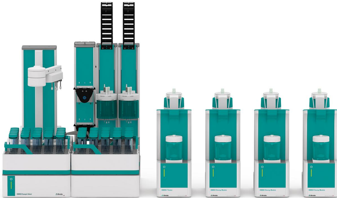
Figure 1. OMNIS Robot S with Discover and parallel analysis.

OMNIS automates the entire analysis process with: