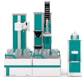
Figure 1. OMNIS system consisting of an OMNIS Sample Robot S and an OMNIS Advanced Titrator equipped with a Profitrode for the determination of the reserve alkalinity in engine coolant.

Afterwards, the solution is aspirated and the buret tips as well as the electrode are rinsed with deionized water. The glass membrane of the electrode alone is then conditioned for 2 minutes in deionized water.