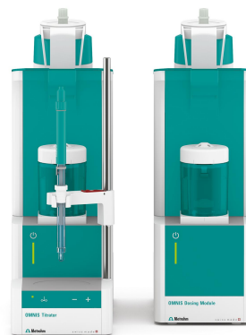
Figure 1. OMNIS system consisting of an OMNIS Advanced Titrator and an OMNIS Dosing Module equipped with a double Pt-wire electrode for indication.

appropriate amount of sample is dissolved in toluene.