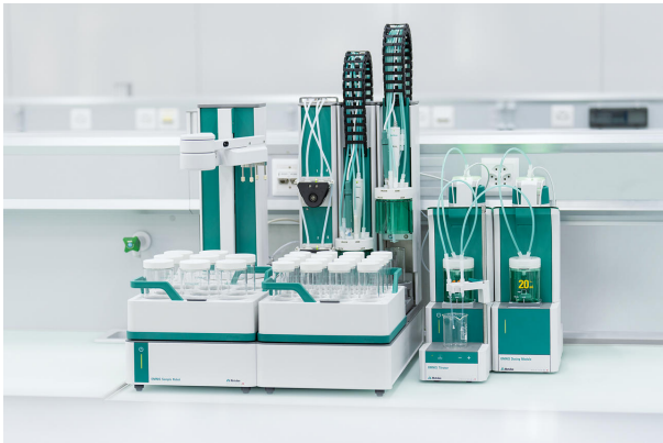
Figure 1. OMNIS Sample Robot S equipped with an OMNIS Titrator, OMNIS Dosing Module, and dSolvotrode for the automated determination of TAN and TBN in motor oil samples.

The determinations are carried out using an OMNIS Professional Titrator equipped with a dSolvotrode on an OMNIS Sample Robot S (Figure 1). To avoid manually handling chemicals, all solutions can be automatically added using an OMNIS Dosing Module. An appropriate amount of sample is weighed into the titration vessel and solvent is added. Afterwards, the solution is titrated until after the first endpoint with standardized potassium hydroxide for the total acid number, or with standardized perchloric acid in acetic acid for the total base number. One exemplary titration curve of TBN with HClO 4 is shown in Figure 2.