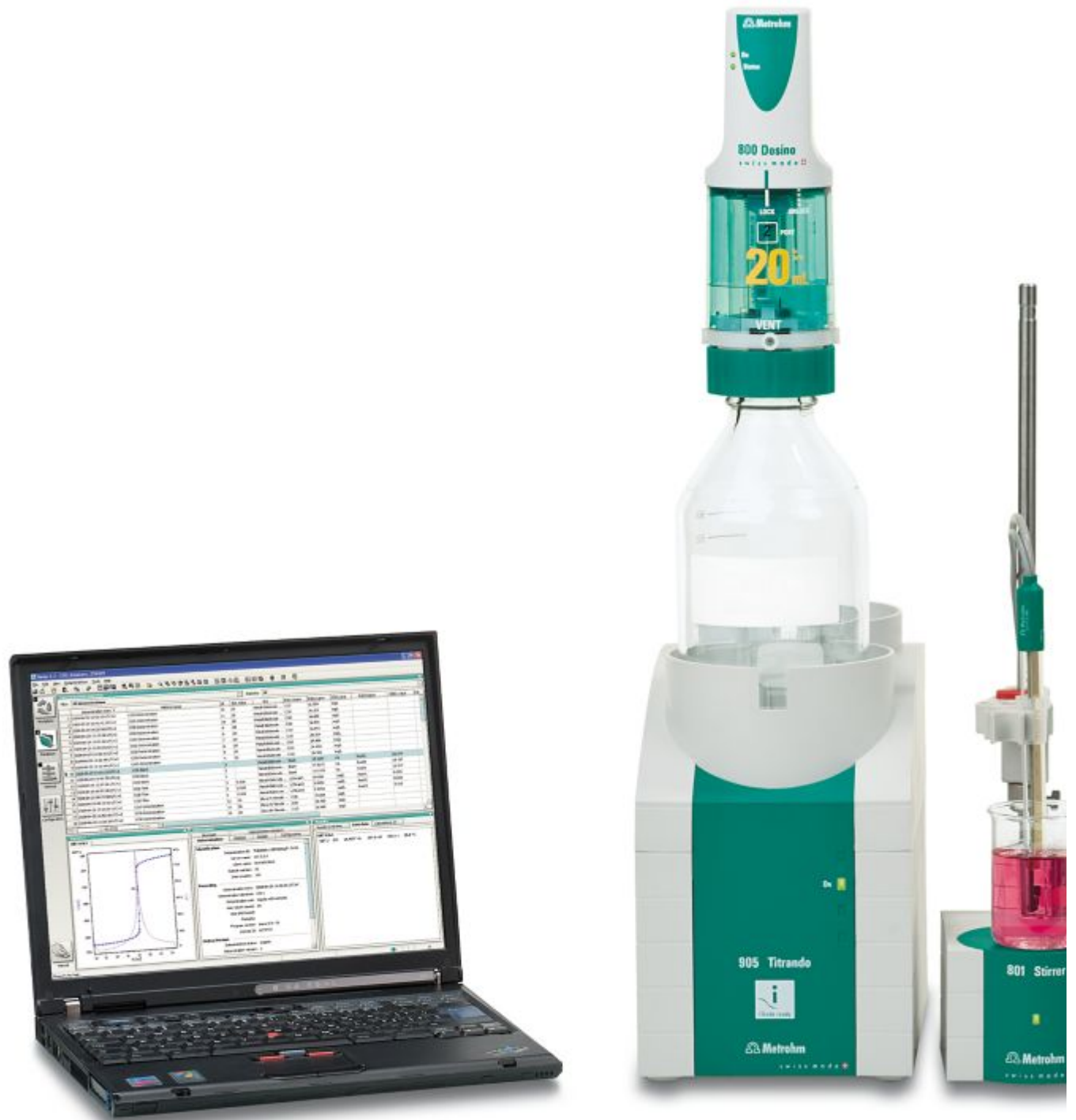
Figure 1. 907 Titrando with tiemo. Example setup for the photometric determination of vitamin C.

This photometric analysis is carried out on a 907 Titrando system equipped with a magnetic stirrer and an Optrode for indication purposes.