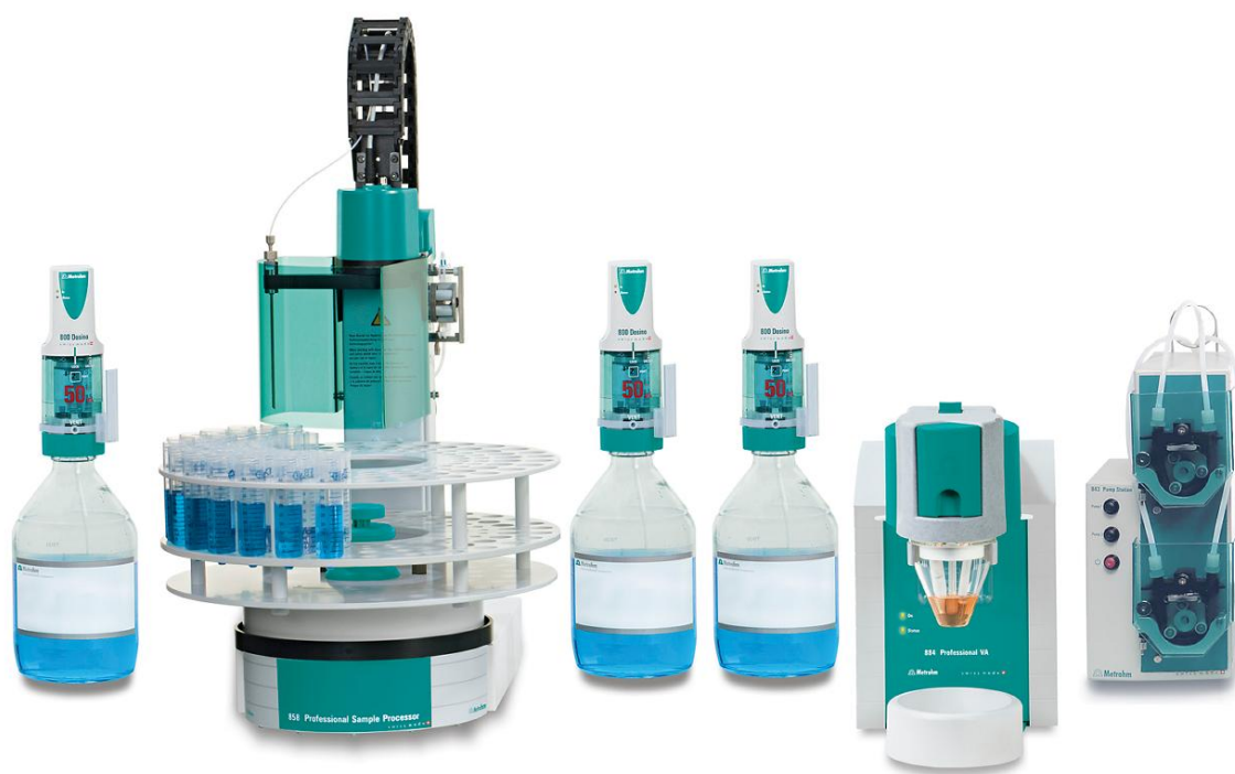
Figure 1. 884 Professional VA fully automated: 884 Professional VA with 858 Professional Sample Processor, three Dosinos, and 843 Pump Station

The complete system is then rinsed before the next sample is started.