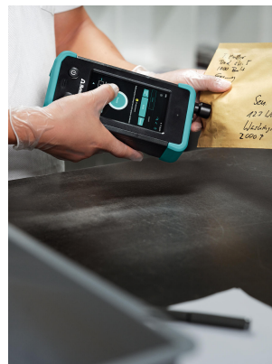
Figure 1. Finding contraband—from fentanyl to anthrax—in the mail is a very real issue. The ability of Raman to scan through paper is an invaluable asset.

TID1064ST with the See-Through (ST) Smart Attachment can measure samples situated inside bottles, envelopes, and even dense chemical storage containers. A unique data analysis algorithm quickly identifies and separates the container signature from the sample signature, accurately identifying both.