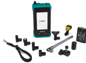
Figure 2. TID1064ST has a suite of sampling attachments for any scenario.