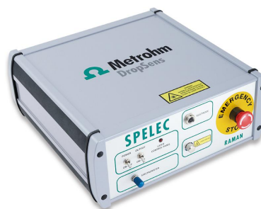
Figure 2. The SPELEC-RAMAN used for the measurements in the application note.

The fabulous, compact and integrated instrument for Raman Spectroelectrochemistry, SPELEC-RAMAN, was used for this Application Note. This instrument integrates in only one box: a spectrometer, a laser source (785 nm) and a bipotentiostat/galvanostat. Screen-printed electrodes (refs. DRP-110, DRP-110SWCNT, DRP-110CNT, DRP-110OMC, DRP-110GPH, DRP-110CNF) were placed in a specific cell for this type of devices (DRP-RAMANCELL) coupled with the DRP-RAMANPROBE, which allows to perform the Raman measurements of the electrode surface at optimal focal distance. Integration time was 20 s.