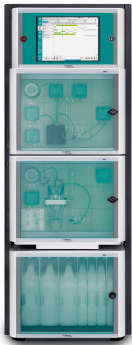
Figure 2. 2060 Process Analyzer for online analysis of ammonia and hydrogen sulfide in the sour water stripping process.

cannot be stripped as a gas. Therefore, caustic (NaOH) is injected at the bottom of the tower to keep the pH above 8, facilitating NH 3 gas formation. Online analysis of ammonia and sulfides will increase the «stripper efficiency» of the SWS, leading to significant steam reduction and increased energy savings. Effectively stripping and monitoring H 2 S and NH 3 is also an essential operation in the overall pollution reduction program of refineries.