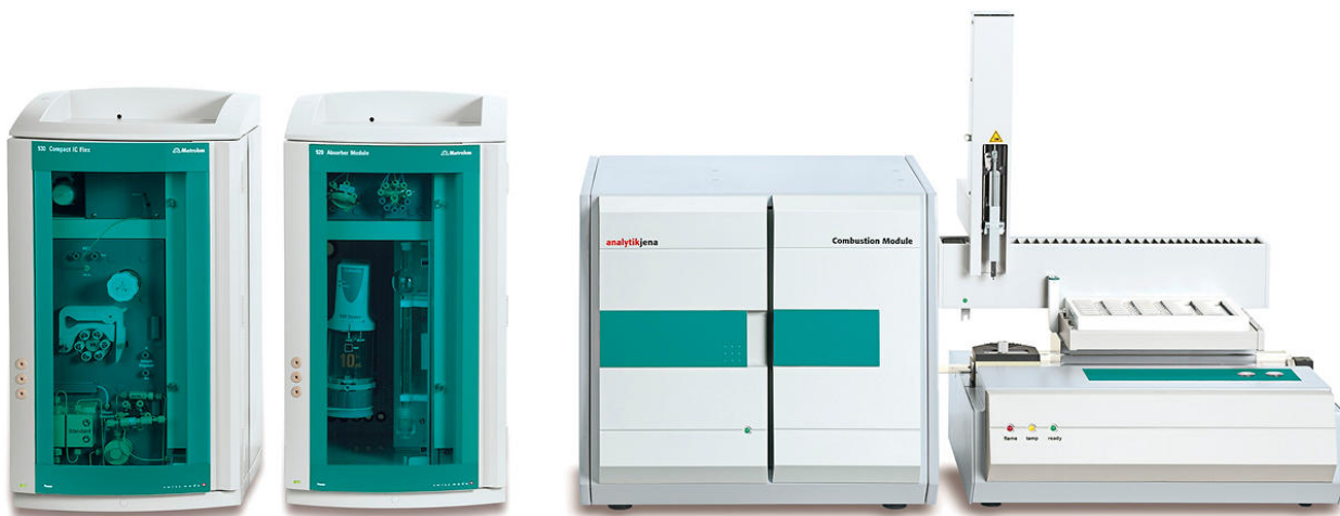
Figure 1. Combustion IC setup consisting of a 930 Compact IC flex (2.930.2560), a 920 Absorber Module (2.920.0010), a Combustion Module (Oven + ABD, 2.136.0700), and an MMS 5000 Autosampler (2.136.0800) configured for solid samples (6.7302.000).

The separation of fluoride (retention time 6.2 minutes) from other halogens is achieved on a Metrosep A Supp 5 - 250/4.0 separation column in combination with the A Supp 5 Guard/4.0 ( Figure 2 ). Automated eluent production with the 941 Eluent Production Module enables continuous and almost unattended operation of the CIC, increasing the overall performance and analysis efficiency. The calibration (0.01–0.5 mg/L) was performed automatically from one standard solution (sodium