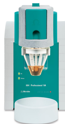
Figure 1. 884 Professional VA.

Sample preparation and the determination of iodine is carried out according to the USP monograph «Thyroid Tablets». The process involves dry ashing of the tablets, where organically bound iodine is released and later converted to iodate. The iodate content is determined with the 884 Professional VA (Figure 1) by differential pulse polarography.