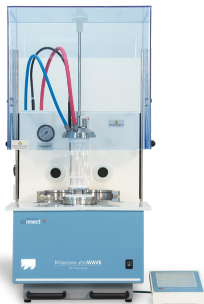
Figure 2. Milestone's ultraWAVE SRC-based digestion system

Milestone offers a wide range of racks and vials, including racks that accommodate vials with different volume types to digest different sample types and amounts in a single microwave program, enhancing the lab workflow and productivity.