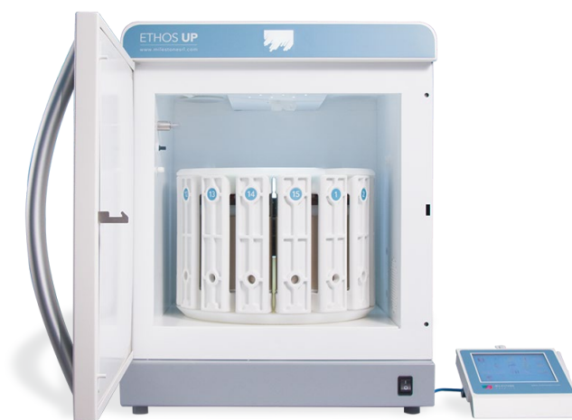
Figure 1. Milestone's ETHOS UP microwave digestion system

Microwave digestion has evolved along with the elemental analysis needs of labs and atomic spectroscopy instrumentation. The Milestone ETHOS UP (Figure 1) represents the latest evolution of rotor-based technology, which incorporates over