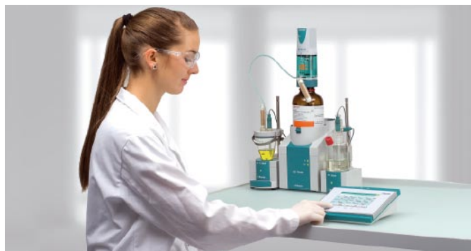
Fig. 3: Metrohm's new benchtop control module simplifies titrimetric analyses.

Metrohm AG Herisau, Switzerland info@metrohm.com www.metrohm.com